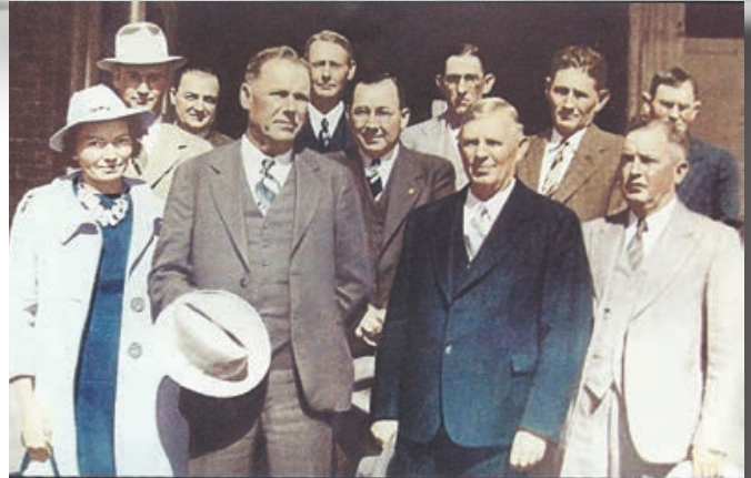
Pictured above: the original board members that made up the first Taylor Electric Cooperative Board in the 1940's.

Here's to the next 85 years of innovation, collaboration, and meaningful impact. As we turn this new page, let's celebrate the cooperative spirit that enriches lives, empowers communities, and promotes a more equitable and sustainable future for everyone.