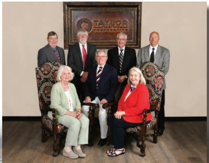
Pictured below: Taylor Electric's current sitting board serving during the 85th year of The Cooperative.